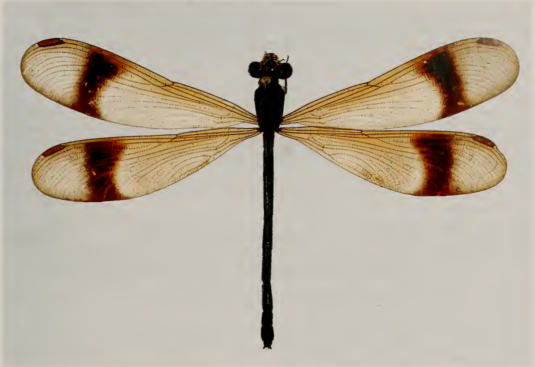
Fig. 2. Polythore spaeteri , spec. nov., female (paratype).

Pterothorax. Black with 5 orange to yellowish stripes arranged in the typical manner described by Bick & Bick (1985) in Polythore lamerceda . Legs black, inner side of femora pale.